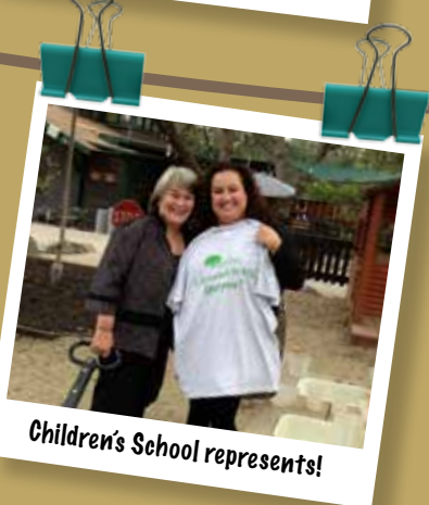
Children's School represents!